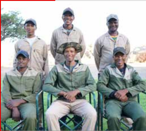
Skinners & Trackers