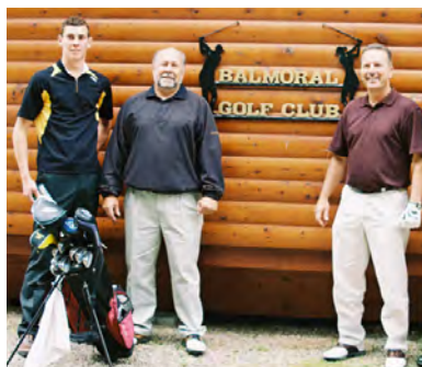
Playing Golf at Balmoral